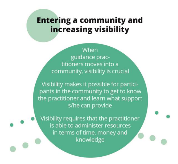
Figure 3: Entering a community and increasing visibility

Here, career guidance practitioners should reflect on the following questions: How should s/he make his/her presence known to the community? How can the practitioner create opportunities for informal interaction with community members? There are a number of ways for practitioners to increase their visibility within a community: using social media, exploring the place of the community and interacting or staying in a certain place. However, practitioners do not only need to be visible to potential participants in career guidance activities, but also to other professionals such as teachers, social workers or community workers. Niles and Harris-Bowlsby (2009, p. 416) point to a need for career guidance professionals to be able to connect with and access resources from other professionals working in a community. They describe this as a three-step process: