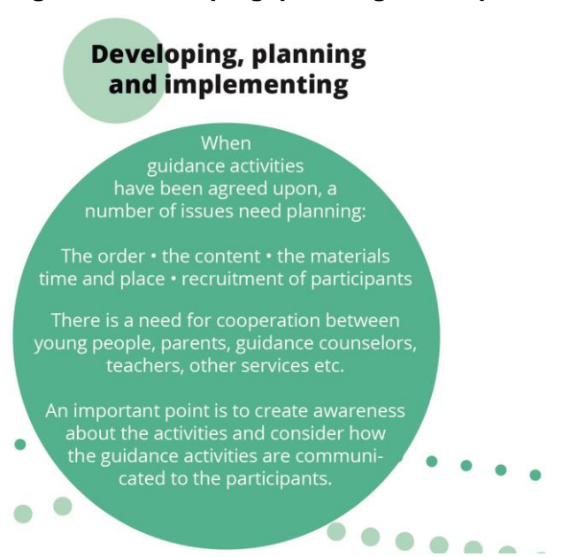
Figure 7: Developing, planning and implementing

After the considerations above on how to decide upon guidance activities, we now turn to thinking about how to develop , plan and implement these career guidance activities. The two elements; deciding on guidance activities and developing, planning and implementing them overlap in practice, but, here they are presented each element separately. This is done to increase transparency, and to emphasises that the analytical and explorative phases that establish context sensitivity and the basis for taking the collective as the starting point for the development of career guidance activities should be given equally as much attention as the planning and performance of the actual activities. This is an analytical and reflexive separation of phases that are dynamic and entangled in practice.