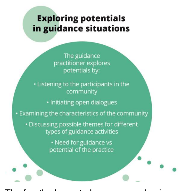
Figure 5: Exploring potentials in guidance situations

Finally, addressing the criticism levelled at several career guidance models and research for overlooking the importance of context (Leung, 2007, Valach & Young, 2009), engaging in the community also serves to emphasise context sensitivity. This engagement with communities in their everyday context serves to explore which career guidance activities could be seen as relevant and meaningful in the specific community. Many policy definitions of career guidance are broad for instance the OECD (2004) provides a very broad and inclusive definition of career guidance as a process that consists of a range of different activities; a definition that allows for creativity and flexibility in terms of adapting and even inventing modes of delivery. The third element in the reflection model is devoted to exploring the potential of career guidance activities.