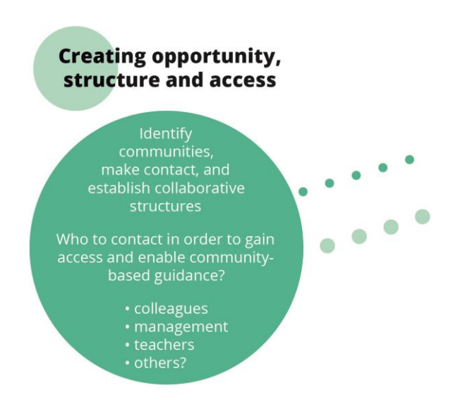
Figure 2: Creating opportunity structure and access