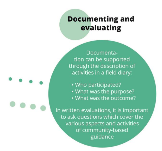
Figure 8: Documenting and evaluating

To document and evaluate guidance activities is equally important when practising career guidance in communities as in one-to-one sessions. However, it is also important to find ways of documenting and evaluating activities that are able to capture this specific mode of delivery. For documentation purposes, the field diary can be used to capture and register encounters in the community with a focus on noting: Who did I speak to? Who did I listen to? Where? What was said? What ideas for activities/important themes/problems/barriers came out of this encounter? These notes can function as the basis for documenting the activities at a later stage. When changes are made in the mode of delivery, considerations about whether the current form of evaluation is able to capture this change are needed. For example, an