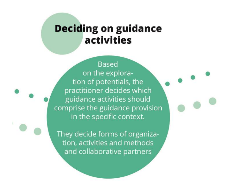
Figure 6: Deciding on guidance activities

The next element concerns reflection on how to choose and decide on guidance activities. The aim is to encourage the career practitioner and their management to challenge the idea that practices can be recycled or 'taken off of the shelf' for all clients and contexts (Mørch 2006). The aim of reflexive practice regarding career